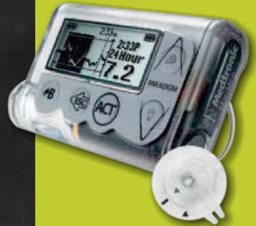
Insulin pump that uses an infusion set

You can push buttons on the pump to tell it how much insulin you want to give at meal/snack times. You can disconnect the tubing when you have a bath, go swimming, or when you play sports.